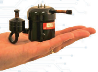
FIGURE 1 - Aspens Miniature Compressor Enables Small Environmental Control Units